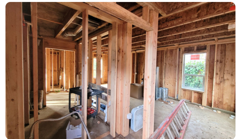
Interior and exterior photos show progress on SVdP's Williams Place as of Jan. 26.

facilities, Williams Place will serve the unique needs of individual veterans. The program will also provide an innovative solution to Oregon's larger veteran housing crisis by supporting as many as 60 each year into permanent housing and connecting them with local resources, medical and mental health care, and the benefits they are entitled to through the county, state, and/or VA.