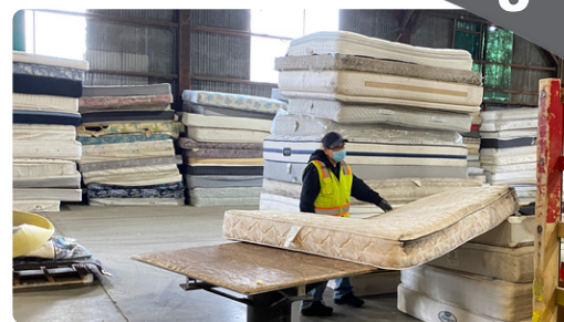
SVdP's Eugene mattress-recycling facility.