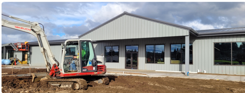
Meile Construction continues work on St. Vinnie's Cottage Grove store in this Jan. 23 photo.