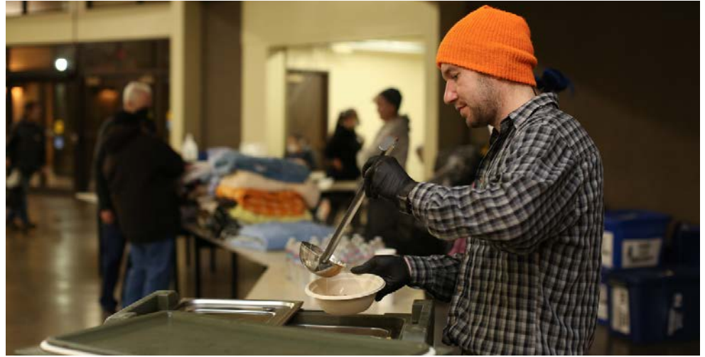
Egan Warming Centers' volunteers make this life-saving service possible.