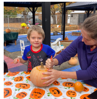
Some recent harvest season festivities, courtesy of SVdP's caring donors!

Your support funds: Youth & Family Services