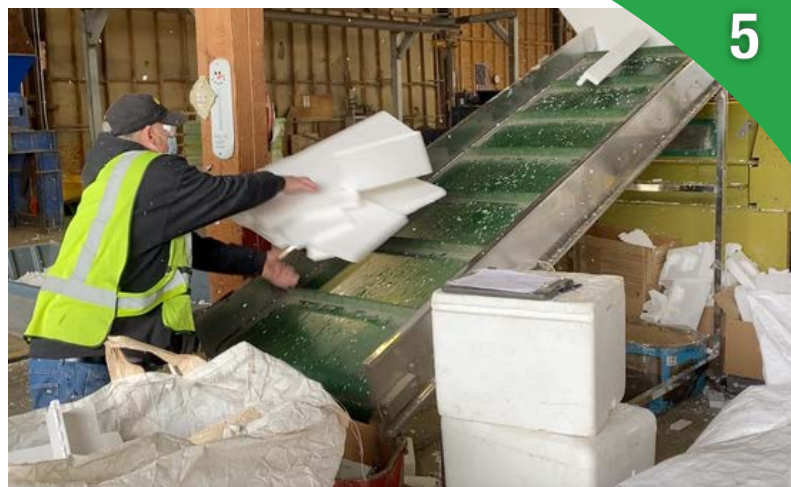
A worker at SVdP's Eugene recycling facility loads a machine that compresses expanded polystyrene (EPS) blocks into dense logs.

Maybe your post-holiday cleanup will also include getting rid of older items to make way for replacements received as gifts. Perhaps your upcoming resolutions for the new year will involve streamlining and simplifying, tidying up the house or cleaning out the garage.