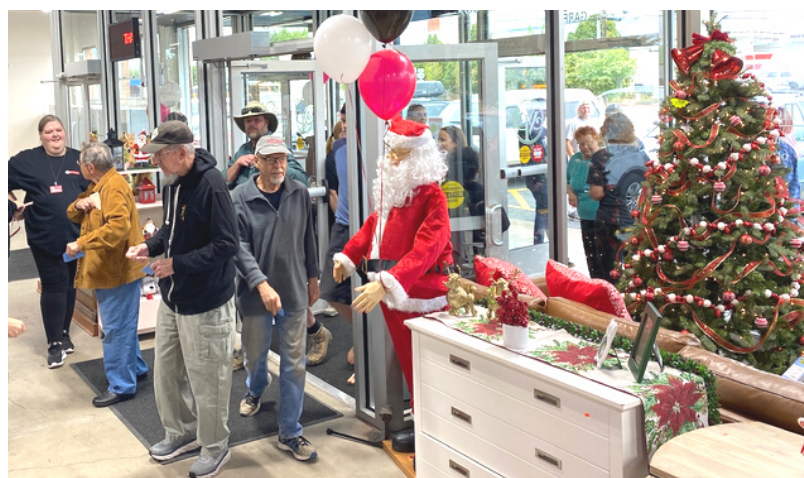
Store staff (along with Santa Claus) greeted eager customers during the grand opening of St. Vinnie's newest location, 888 Garfield St. in Eugene.

So please read on to count the ways you can keep your holiday season green with the help of St. Vinnie's. At the same time, you'll help promote health, security, abundance and harmony in your community and fend off that most infamous of green grumps, the Grinch!