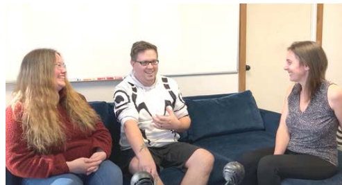
410 Garfield staff talk services, partners, guests.

Listen in as we sit down with staff at our 410 Garfield Safe Sleep Site, one of two emergency shelters SVdP operates for the City of Eugene. Hear about the origin of the 410 site, the journey our residents take to transition from street to stability, and the wonderful community partners that help make our work possible!