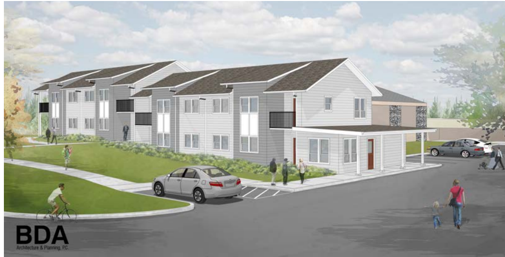
Architects' rendering shows Ascend Home, new SVdP transitional housing to open in 2023.

S VdP broke ground July 12 on Ascend Home, a new eight-unit transitional housing apartment complex adjacent to SVdP's First Place Family Center at The Annex, 4060 W. Amazon Drive. These units will provide supportive housing for local families transitioning out of homelessness, serving as a new resource designed to bridge the daunting gap they face between emergency shelter and long-term housing. The project is made possible by a $2 million donation from CBT Nuggets, a Eugene-based online IT training company.