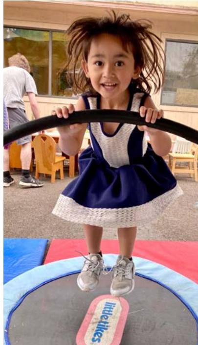
A preschooler enjoys a new play area at The Annex, now home to First Place Family Center and First Place Kids after a consolidation of SVdP's emergency family services into one site.

Our YFS team and participants are loving their new space, 2 miles down the road from the previous FPFC/First Place Kids location, and settling in at The Annex. Thanks to SVdP's maintenance team, new shade structures allow kids to enjoy outdoor play time. And in addition to standard programming, weekly Family Fun Days and monthly Family Wellness Events will soon return at the new location.