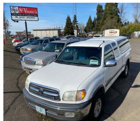
In 2021, the median price for a vehicle sold at St. Vinnie's Car Lot was $1,000.

But did you realize that St. Vinnie's also accepts donations of used cars, trucks, motorcycles, and other vehicles, running or not? Your unwanted rig can also generate resale/recycling proceeds to help people in need, might earn you a tax deduction, and can provide