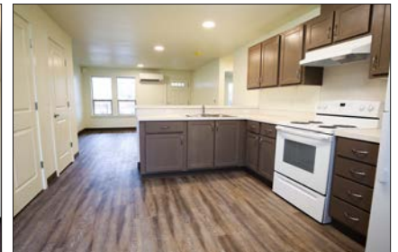
Clockwise from top: Aerial view; an apartment kitchen; community building interior.

On her first visit to Iris Place, Mayor Lucy Vinis said "I am both delighted to see it because it's just beautiful, but I'm also inspired by this project because it incorporates so many of the elements that we consider priorities. It meets everything that we want it to meet in the City of Eugene."