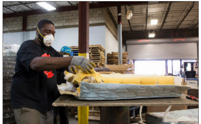
A worker deconstructs a mattress at Greater Bridgeport Community Enterprises, a Cascade Alliance member.