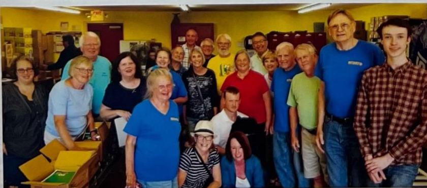
Atkinson Food Room

Volunteer groups help sort goods for families in need