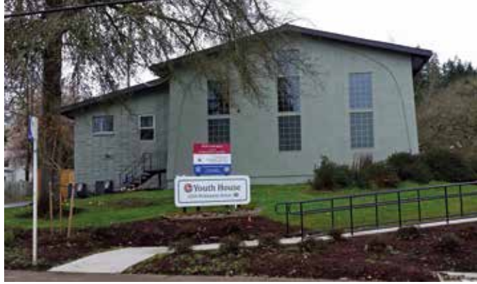
It's been all uphill, but the Youth House will soon be occupied.

In late 2016, SVdP purchased the former Cascade Presbyterian Church with a $620,000 federal HOME grant awarded by the Eugene-Springfield Home Consortium. Over the following year more than 500 individual and business donors and 20 foundations provided the funding needed to remodel the 8,000-square-foot church. The Youth House, which will accept its first residents later this month, includes