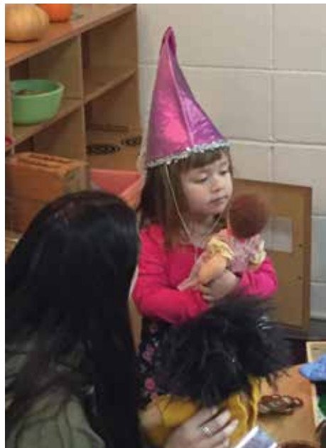
... princess caregivers...