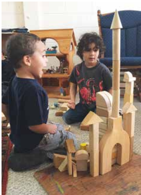
Who are First Place Kids? They are the space travelers of the future...