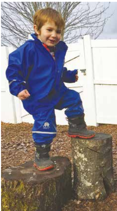
The playground at First Place offers security and just enough challenge.