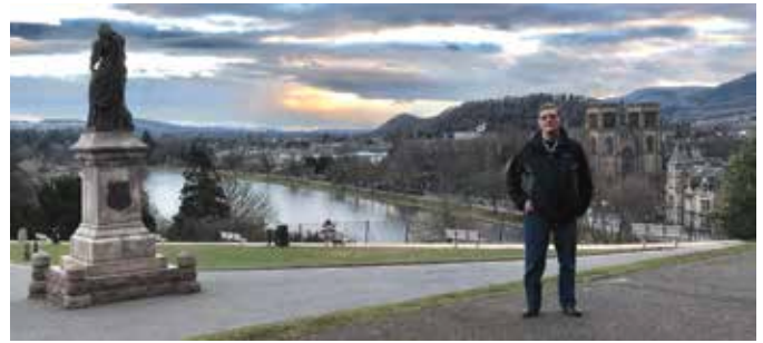
Our fearless leader, flanked by the Jacobite heroine Flora MacDonald and the Castle Wynde in Inverness, Scotland.

Less than a mile away from the Youth House in another former church on west Amazon, work is underway on "The Annex," where First Place will provide a residential program for families experiencing homelessness. Made possible by an anonymous $2 million donation, this project will move our 27-year-old Interfaith Night Shelter program to this complex, creating 18 apartment units for short-term residential housing and making it the new home of First Place's trauma-informed preschool program. We also plan to build a neighborhood community facility that will be accessible to both neighbors