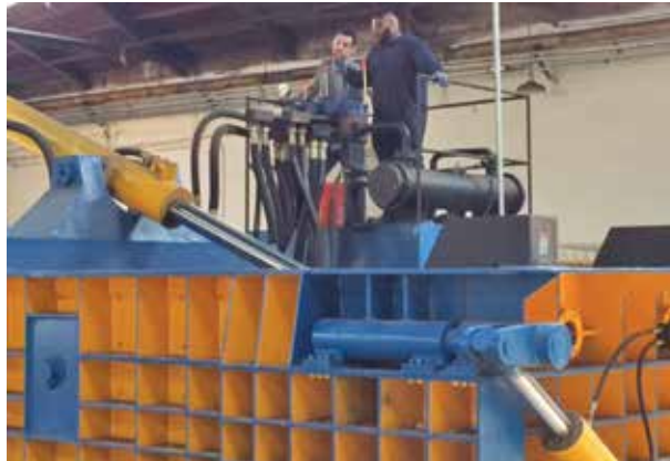
Stockton-based monster baler dwarfs its handlers.

lenge. They don't lose their springiness over time and cause headaches for the scrap metal processors we sell them to for remanufacture into other products.